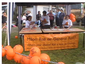
The promotion team at the River City Fun Run...